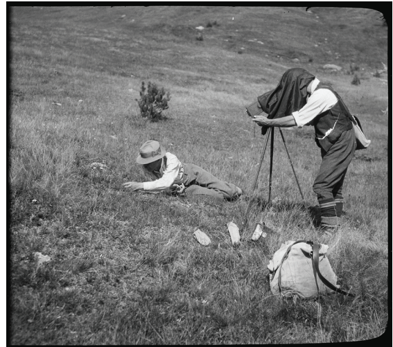
Figure 2 – Research as driving factor of the Swiss NP.

The motivation for establishing the NP derived from scholarly intentions to explore the development of nature once all human uses were abandoned. The initiative was taken by the explorer Paul Sarasin, president of Schweizerische Naturschutzkommission (Swiss Commission of Nature Conservation) established in 1906. Inspired by the early American NPs, the idea was to select an area which would be declared absolute free for animals and plants and in which any human interference would be prohibited ("welches für Tiere und Pflanzen zum absoluten Freigebiet erklärt würde, im welchem also jeder Eingriff in den Bestand des pflanzlichen und tierischen Lebens ausgeschlossen sein müßte" Schweizerische Naturschutzkommission 1909a). The search for an appropriate location for this experiment led to the valley of Cluozza, one of the economically least developed regions of the country. The communities were dependent on low-income farming and forestry and faced collapsing timber prices in the early 20 th century. Hence they welcomed the idea of a NP based on attractive lease agreements: In 1909 a first contract with the community of Zernez was signed and further communities should follow. The Swiss parliament proclaimed the NP in 1914 and gave way to scientific works that until today have shaped the park's identity and its designated use as open air laboratory