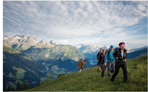
Figure 7 – Magic Moments. Cooperation between parks and tourism, example of Hohe Tauern National Park Carinthia.

The predominant narrative of this conception draws on the integrity and beauty of nature that gets disturbed and destroyed by any kind of human