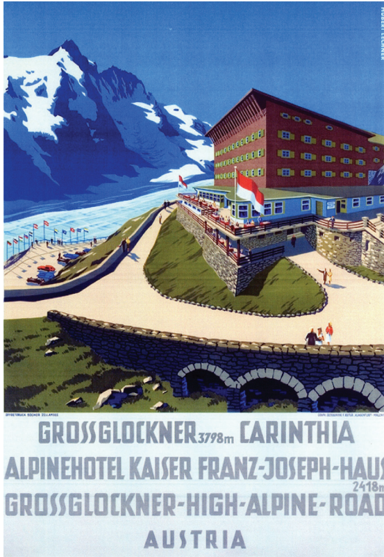
Figure 6 – Destination Hohe Tauern. Großglockner, Pasterzegg, Kaiser Franz-Josephs-Haus . Poster (ca. 1950).

federal states of Carinthia, Salzburg and Tyrol laid the foundation for the creation of a NP. Referring to the 1970 European Conservation Year, they agreed to “conserve the Hohe Tauern [...] in their originality and beauty [...] for the good of society, science and the economy for all time” (Floimair et al. 1985). The approaches of sustainable tourism, emerging in the 1980s, were considered useful concepts in this regard.