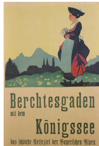
Figure 3 – Alpine tourism Berchtesgaden. Poster by Anton Reinbold (ca. 1910).

The area of Berchtesgaden had long been used for touristic purposes. For example, St. Bartholomew's