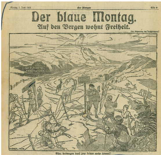
Figure 5 – Early debate about a public right of way. Cartoon by H. Einer (1914).

The story of Hohe Tauern NP starts in the early years of the 20 th century and, after countless intermediate steps, reached a temporary end in 2006 with the international recognition by the IUCN of the Salzburg part of the NP. While the early years were marked by scepticism of environmentalists towards touristic over-usage of the park, the debate around hydropower utilization soon became a priority issue.