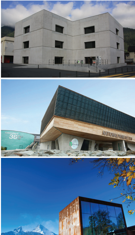
Figure 7 – Visitors centres as landmarks. Swiss NP (Zernez), Berchtesgaden NP (Berchtesgaden), Hohe Tauern NP (Mittersill).

character. Certainly the development of the park has changed the perception of tourism from opponent to ally. However, the discussions have not yet come to an end (Butzmann & Job 2016). In the last decade integrative development (conception 6) has emerged.