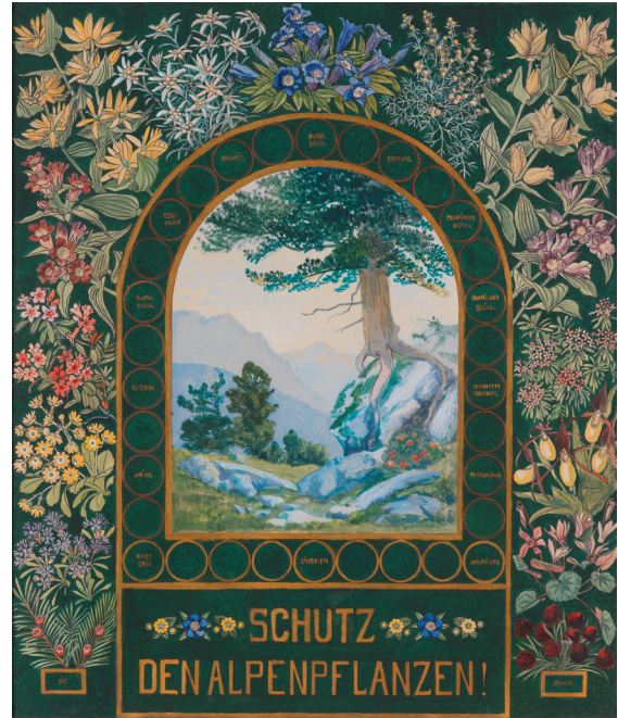
Figure 4 – Protect Alpine Flora. Poster by Gustav Jahn (1910).

Today tourism and NP cooperate in many respects. However, the NP brand has until recently only played a subordinate role in the highly developed, traditional destination of Berchtesgaden (Butzmann & Job 2016).